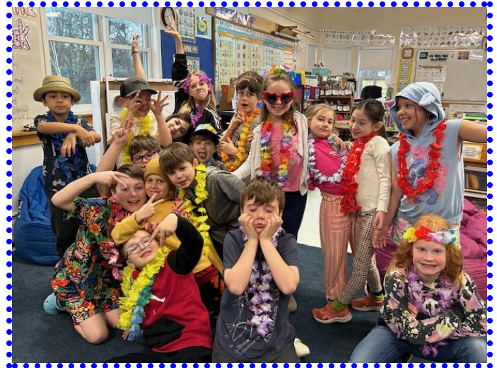
Hawaiian Luau Day

students or new students to South Hampton can register for the 2024-2025 school year by visiting our school website: https://www.sau21.org/barnard/ .