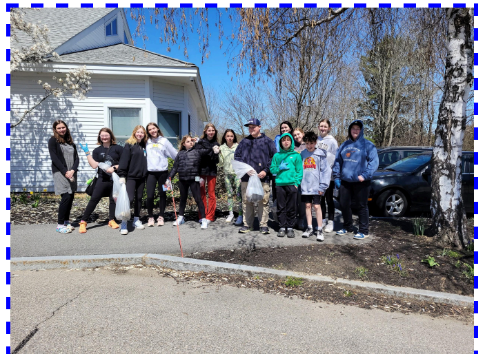
Earth Day Clean-Up Crew