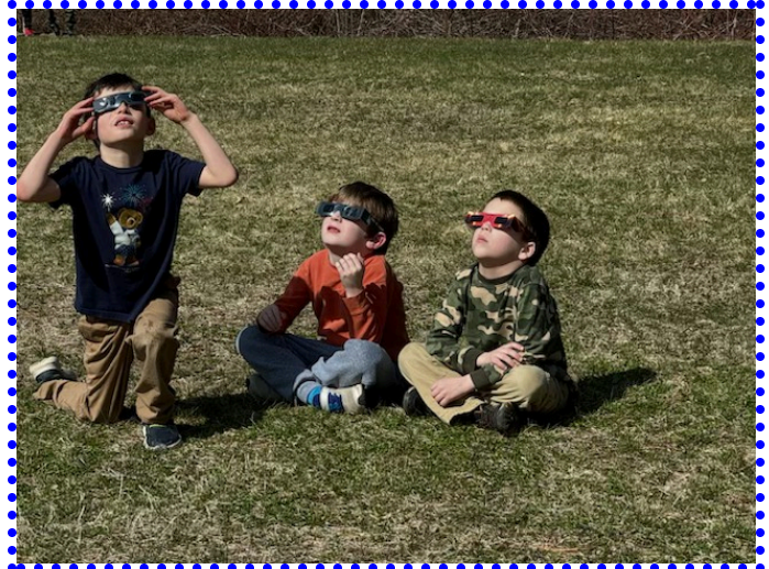
Solar Eclipse Watch Party

Order your 2023-2024 Yearbooks now! Click here to place your order. Orders are due by May 11, 2024.